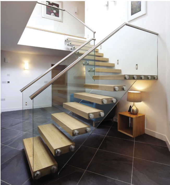
Cantilever straight stair