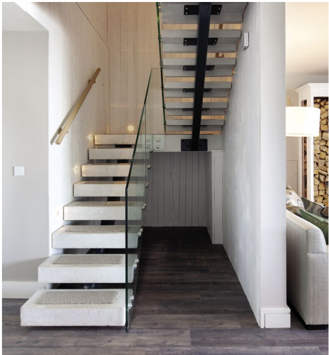
Straight spine beam