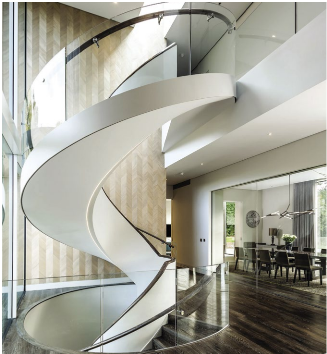
Helical (curved) staircase