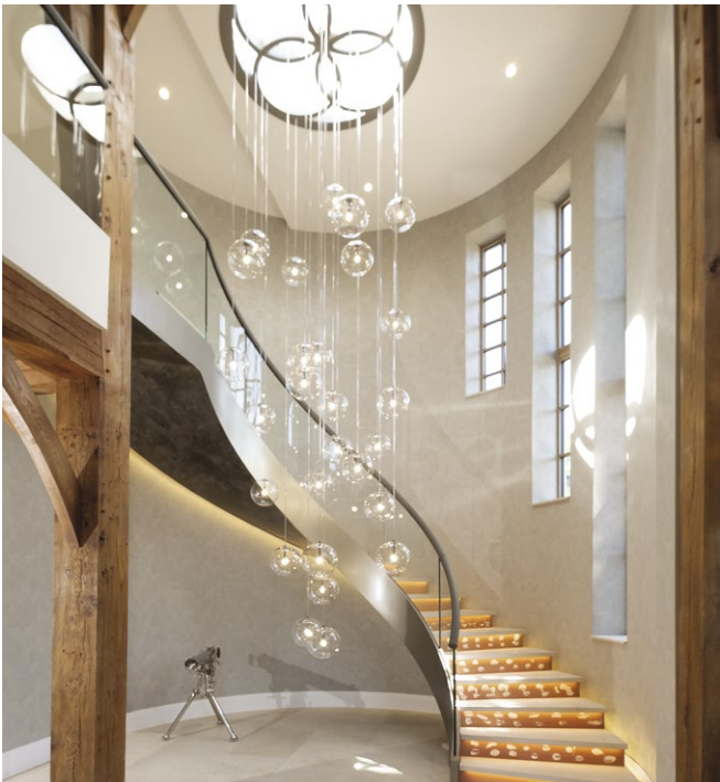
Helical (curved) staircase